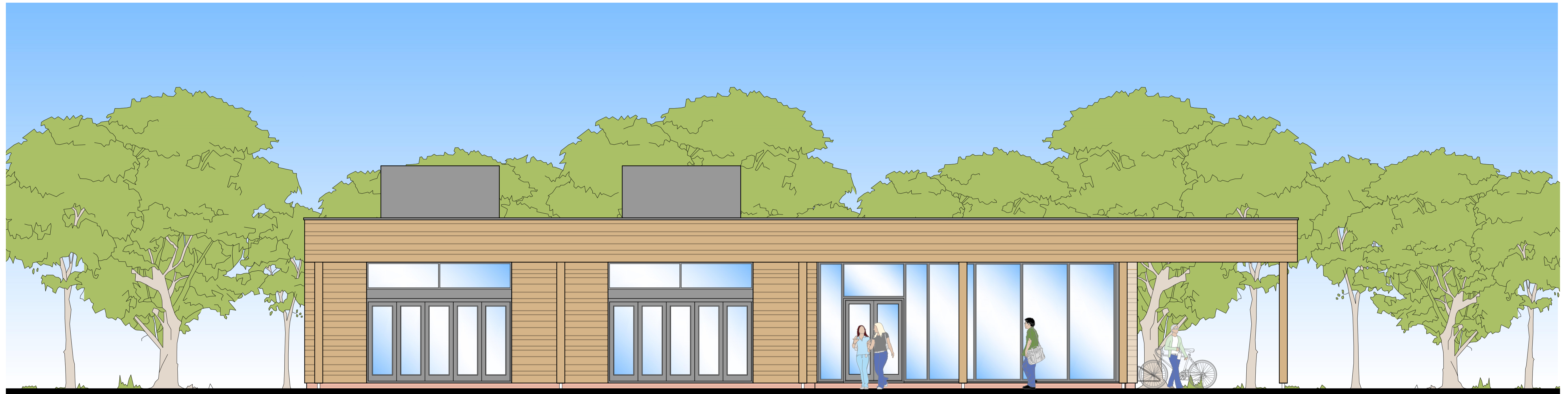
South West Elevation 1:50