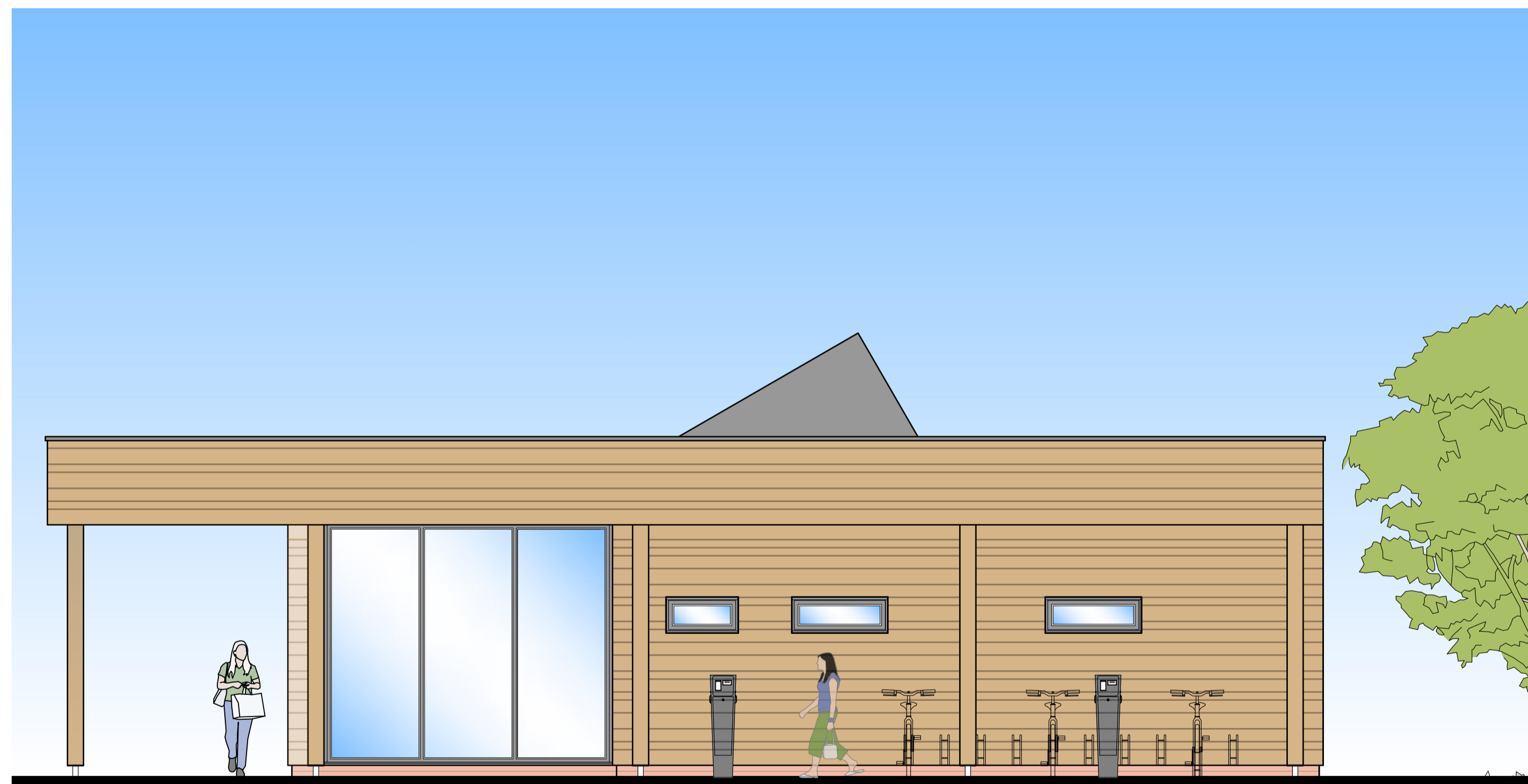
South East Elevation 1:50